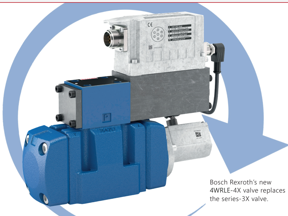
Bosch Rexroth's new 4WRLE-4X valve replaces the series-3X valve.